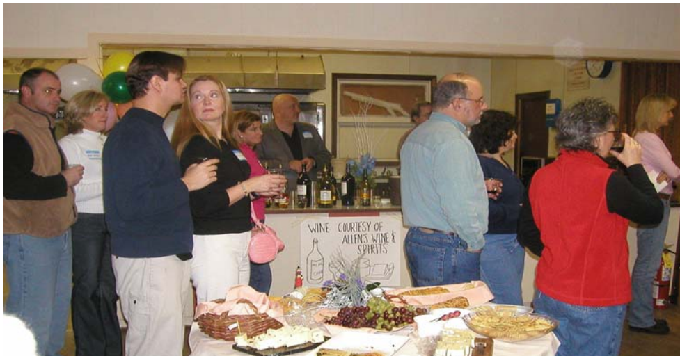
CFPIA Neighbors gather at the Wine and Cheese Social

The CFPIA would like to thank everyone who attended our first Wine & Cheese party. We invite everyone in the community to join us in establishing some fun and community inspired activities at Common Fence Point.